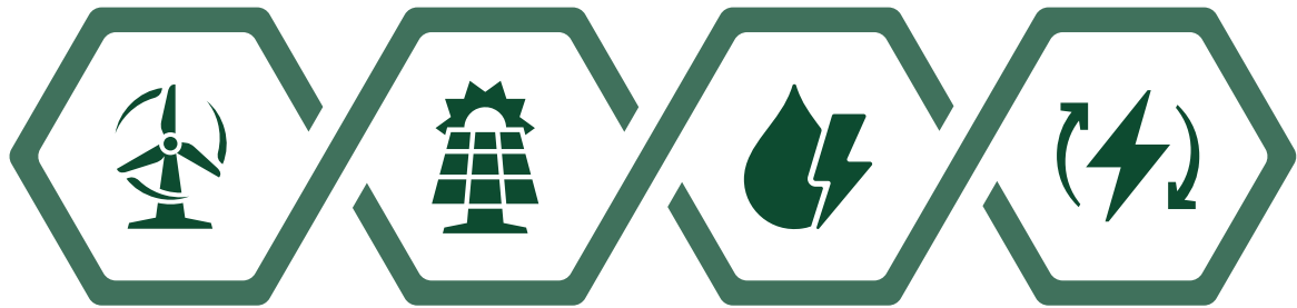
Wind Solar Hydro Other Renewables